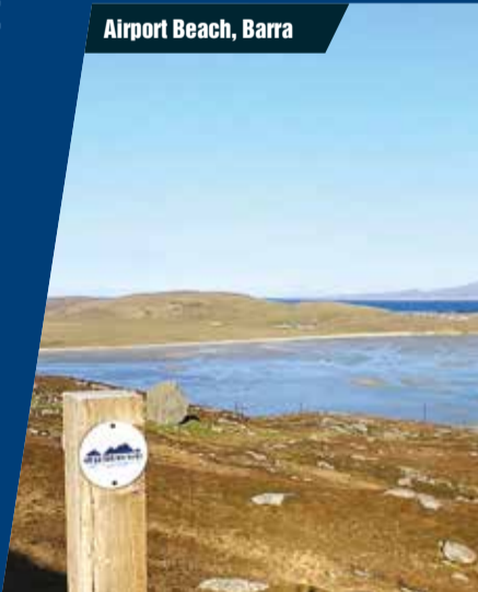
Airport Beach, Barra

Benbecula offers some fine and varied walking. Starting off along the sandy beaches of the west coast, the Hebridean Way then heads inland through fertile croft fields before climbing the small hill Ruabhal. From its summit the views to the east are astonishing – a semi-submerged landscape with more water than land. Another causeway leads north to Grimsay, a tiny island with a thriving fishing community.