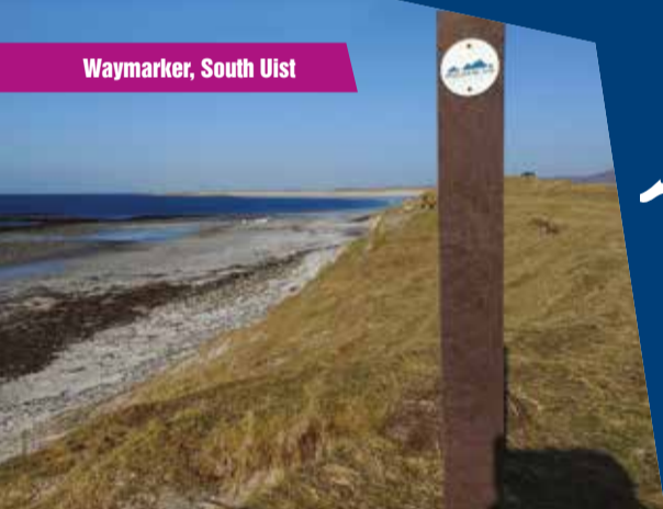
Waymarker, South Uist